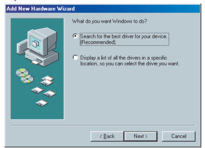
Sélectionnez Rechercher le meilleur pilote pour votre périphérique (recommandé).

2. Cliquez sur Suivant. La fenêtre ci-dessous s'affiche.