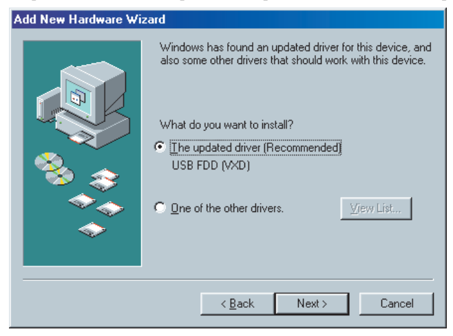
Cochez l'option recommendant d'utiliser le pilote mis àjour.

6. Cliquez sur Suivant et répétez les étapes 2 et 3. La fenêtre ci-après s'affiche.