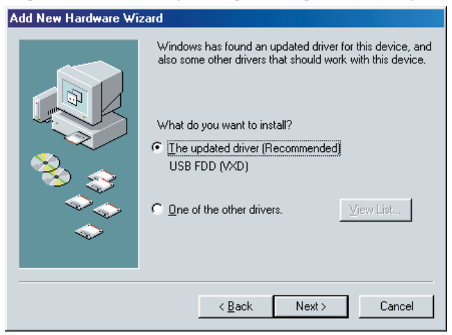
Selecione The updated driver (Recommended).

6. Clique em Next e, em seguida, repita as etapas 2 e 3. A seguinte janela é aberta.