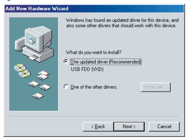
Seleccione El controlador actualizado (se recomienda).

6. Pulse en Siguiente y, a continuación, repita los pasos 2 y 3. Se abrirá la ventana siguiente.