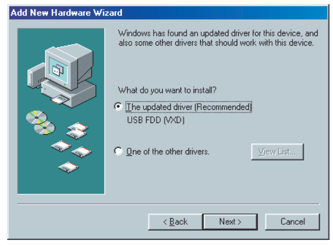
選取 更新的驅動程式(建議的) 。