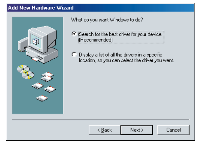
Selecione Search for a suitable driver for my device (recommended).

2. Clique em Next. A seguinte janela é aberta.