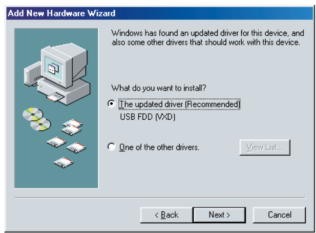
Selezionare Driver aggiornato (scelta consigliata).

6. Fare clic su Avanti e poi ripetere i passi 2 e 3. Viene visualizzata la seguente finestra.