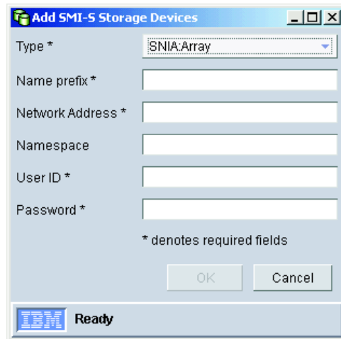
Figure 2. "Add SMI-S Storage Devices" window