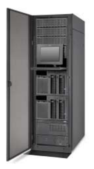
NetBAY™ 42 Enterprise Rack

"We found IBM's management suite to be comprehensive, easy to get up to speed on and effortless to administer from. IBM gets an A+ rating for manageability...."